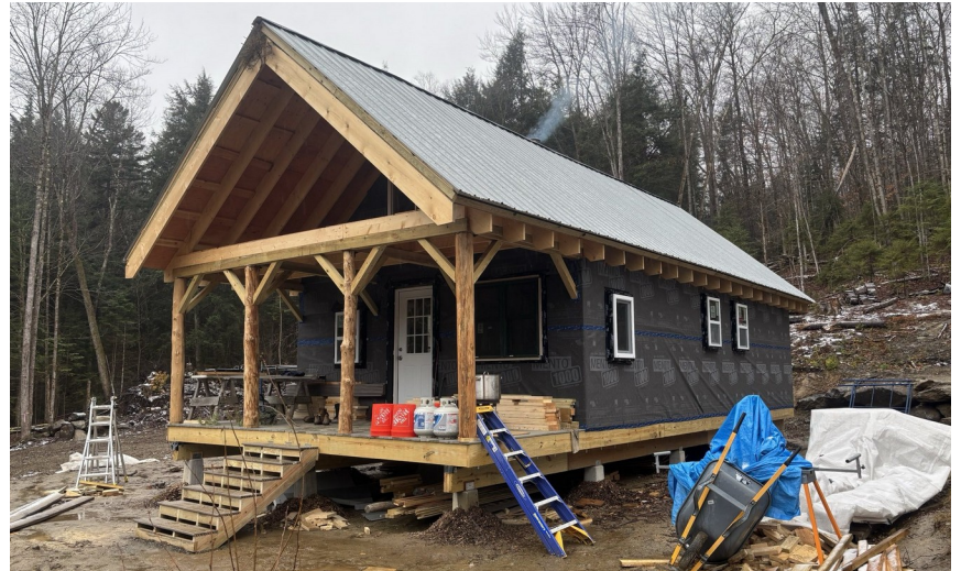
Community House in Montpelier Vermont where our summer solar immersive training will happen.

Most of the rural expanse of Sub-Saharan Africa has no grid power. Many people rely on flour ground by stationary diesel engines powering hammermills. Those mills are expensive to run and rely on a daily supply of diesel. Millions of dollars have been spent to try to run those hammermills on solar power. As we discussed in the last newsletter, that results in very sophisticated and expensive answer to foolish question. The wise question is to figure out how to run a burr mill on solar power.