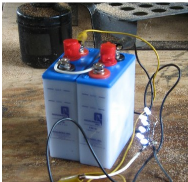
Two cell NiFe set, $36 in batteries, 6 cents in LEDs, no charge or discharge regulation necessary. The "bulb" here has been burning for over a week.

Now notice another picture, a screen shot from the webpage of Barefoot College, an organization in India. As much as we know of Barefoot College, they seem to be a great organization. They offer renewable energy support for the poorest of the poor in India, including teaching them how to build solar lanterns, solar hot water and cooking systems, etc. The screenshot of their webpage shows the (not simple) electronic circuits they use on their solar lanterns, and the weathered hand of a woman being taught how to build them. (Look closely you will see she is holding a resistor in her hand, a small electronic component to be soldered to the board.)