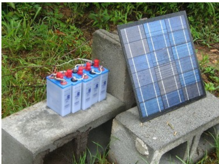
Five cell, 6 volt NiFe set charging directly from a PV panel.

Dating at least as far back as Edison's time, the primary focus on battery research has been power density. Edison intended NiFes to be used in electric cars. NiFes were used quite a bit in the early 20th century. Why did they vanish so completely? The same reason that low-speed cast iron engines and durable, repairable appliances vanished -- the accelerating turnover of capital. Like many older machines, NiFes are heavier, bulkier, and much, much more durable. But selling machines that are smaller, lighter (thus having lower production costs), and less durable is far more profitable. In 1910, 3% profit was considered a good thing. Now any company making 3% would be liquidated. NiFes died in the accelerating move toward planned obsolescence. They are big, heavy, expensive, and durable. They last too long. They are not as