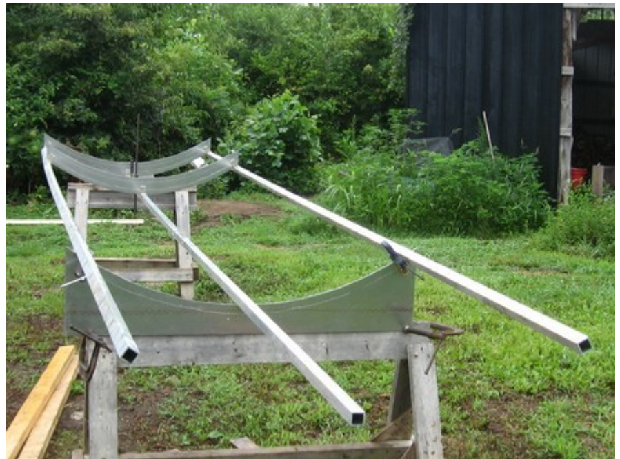
Solar trough, the next generation. We are trying to miniaturize industrial solar high temperature storage to make it possible to cook with stored solar heat anytime.

We certainly don't mean to criticize Barefoot College. They are much larger