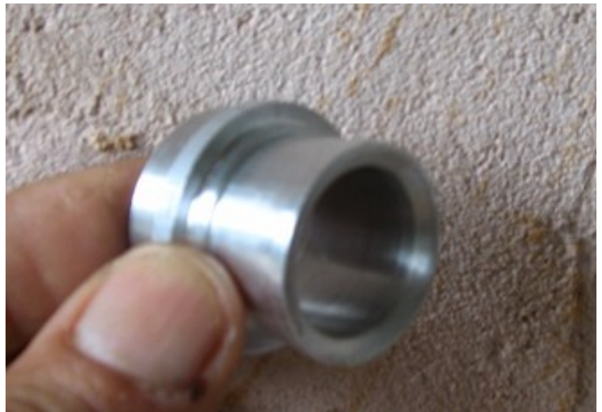
Carburetor venturi for an old Wisconsin engine that is designed to be durable and run on diverse fuels, machined on our lathe while it was raining.

We have been using nickel-iron (NiFe) batteries for 7 years now, and they work amazingly well. We have learned that the rating system for batteries is completely wrong. A NiFe with a rated electrical output will easily outperform lead-acid batteries with five times as much rated output. NiFe batteries got pushed off the market many years ago. Most people have simply never heard of them.