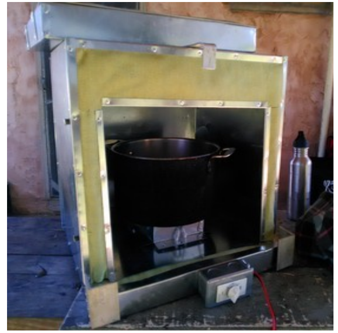
Roxy Deluxe, the nicest solar cooker we have ever made. These ISEC cookers can cook in partly cloudy weather when it's bitter cold outside. No other solar cooker on the planet can do that.

4) We are also going to be able to distribute solar PV panels to power these devices and more. Basically, we are are looking at adapting LEF's microgrid to household/ farm