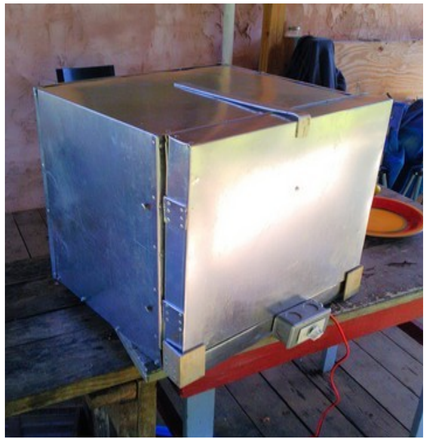
Roxy Deluxe with the door closed. These will probably be marketed soon through Living Energy Lights (.com) and in Jamaica.