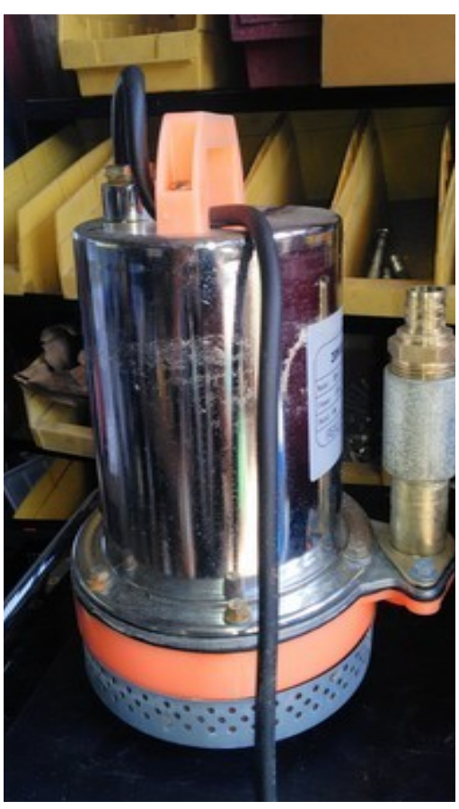
Low-pressure Chinese made brush motor sump pumps that can run directly from a PV panel. The cheapest decent little pump we have ever found, these could make a big difference in the lives of many people who have little money.

The bureaucracy moves at a snail's pace in Jamaican government. But we have a joint board of Jamaicans and Americans on the board of a forming non-profit that will be fully empowered to distribute solar equipment in Jamaica. (In Jamaican parlance, nonprofit is a category in between for-profit and charitable, the latter being similar to an American 501-c-3.) The company is called